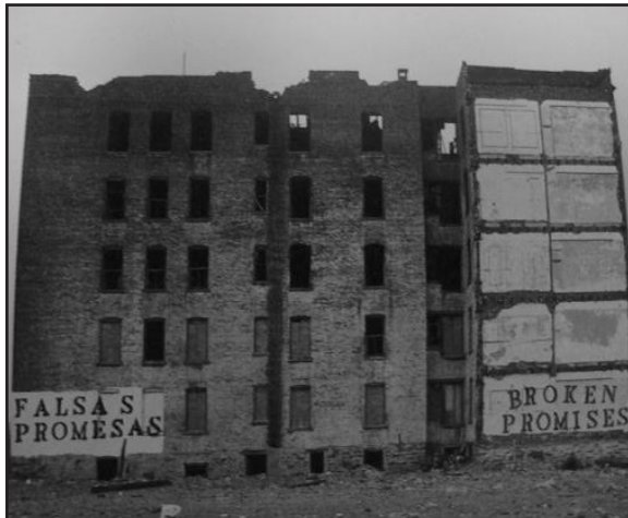
A derelict building in The Bronx

Beginning in the 1940s, New York embarked upon infrastructure and urban renewal projects that would reshape the city, including the culturally-rich working-class neighborhoods of the South Bronx. The game takes its name from one particularly infamous infrastructure project, an expressway conceived of and championed by the city's "construction coordinator" Robert Moses, which from 1948 to 1972 gradually cut through the borough, disrupting neighborhoods and businesses alike. This, and other similar infrastructure projects, impacted the local fabric of existing communities in ways that are still having an effect to this day. If players manage to keep the city afloat, new opportunities emerge to transform the South Bronx according to their own vision, but if too many vulnerable people are lost or if the city goes bankrupt, everyone will lose. Can you cooperate better than the historical actors did and pull the South Bronx back from the brink of disaster?